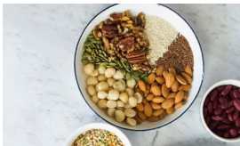
Nuts/Seeds 2–3 Tbsp