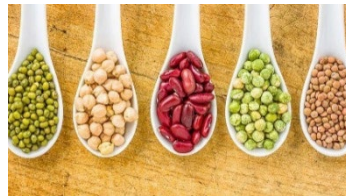
Legumes such as chickpeas, lentils, black beans, soy foods etc. (2–3 times per day for non-meat eaters)