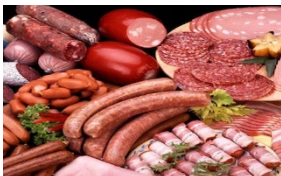
Processed meats (bacon, deli meat, sausage, hot dogs)