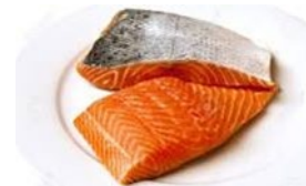
Fish or seafood (with at least one fatty fish such as salmon or sardines in a week)